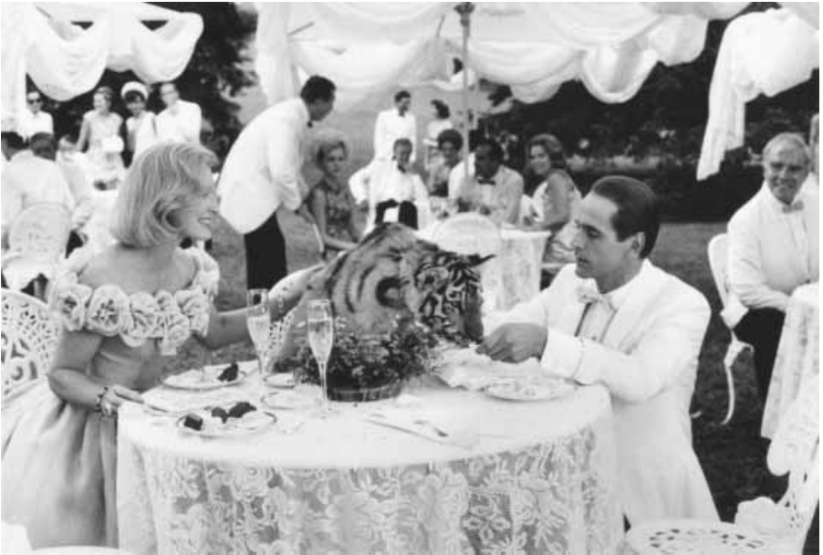
64. Reversal of Fortune : A flashback shows the brittle charm of the von Bülows' courtship. (Glenn Close, Jeremy Irons)

64]. When Dershowitz taxes him with his indifference to Sunny's fate, he replies, "Of course I care, Alan, I just don't wear my heart on my sleeve." At von Bülow's Manhattan apartment, painterly, symmetrical shots of von Bülow and his mistress, Andrea Reynolds (Christine Baranski), are intercut with even more severely symmetrical shots of Dershowitz perched uncomfortably alone in a chair in the center of the frame.