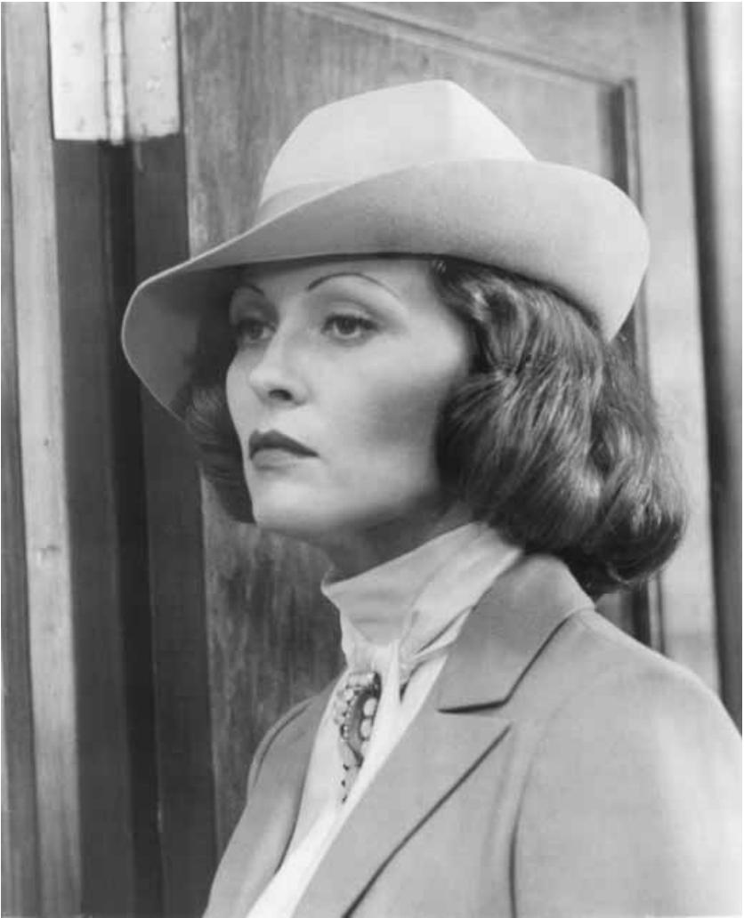
46. Chinatown : The glacial Evelyn Mulway (Faye Dunaway) as the hero first sees her.

No sooner, however, has the film replaced the normal visual duality between nature and culture with a thematic duality between its dream-like landscape and its down-to-earth hero than it begins to complicate it. Rumors about Mulway's scandalous affair, leaked to the newspapers, bring Gittes an icily menacing visit from the real Evelyn Mulway (Faye Dunaway) [Fig. 46], which forces him to acknowledge that he has not only, in classic private-eye form, been decoyed into taking the