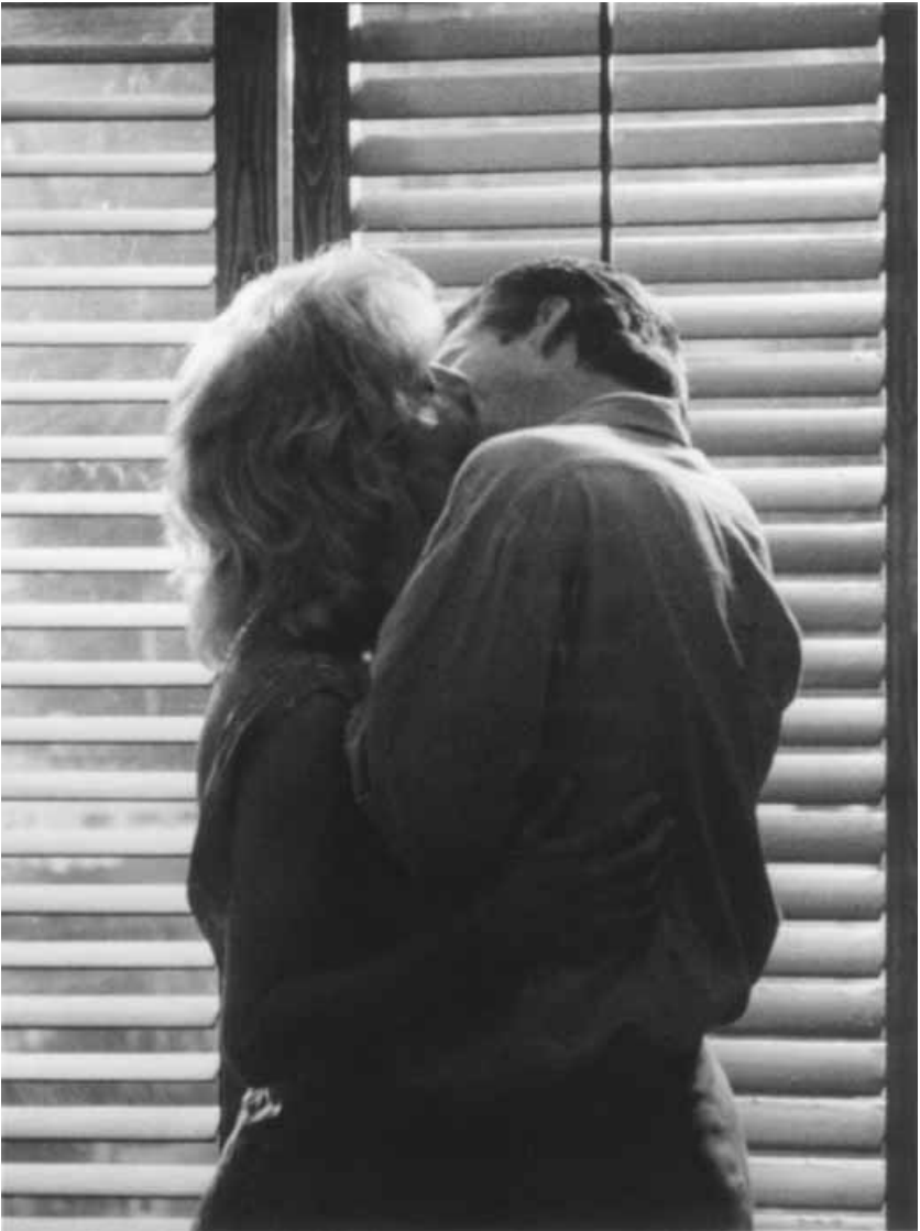
16. D.O.A. (1987): The doomed hero gets a new lease on life. (Meg Ryan, Dennis Quaid)

small-town accountant who is slipped a poisoned drink at a crowded, noisy San Francisco bar. By the time he learns he has been poisoned, nothing can be done to stop the poison's action – he will be dead in a day or two – but Frank, after the initial denial, shock, and depression