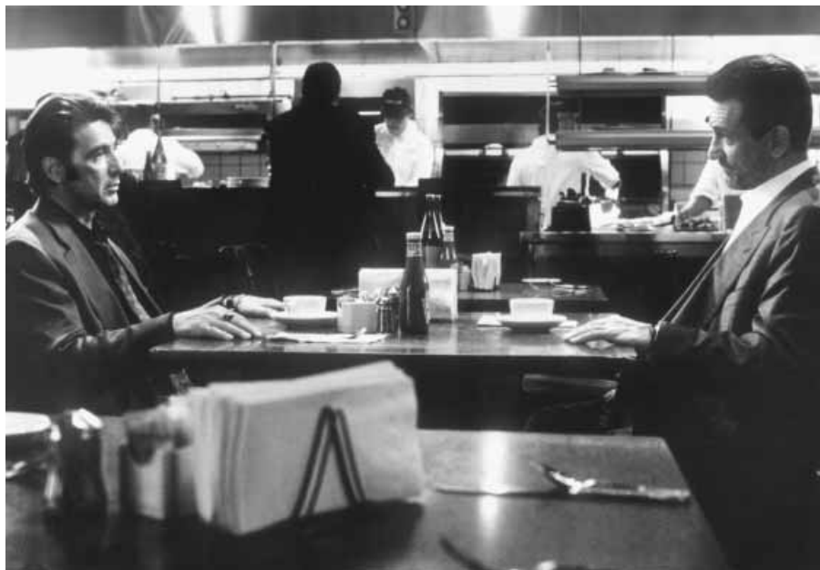
53. Heat : A historic pairing of Al Pacino and Robert De Niro as a cop and his equally obsessive criminal double.

the rights of suspects, rather than the conflicting rights of the larger society, that they help obviously guilty suspects go free.