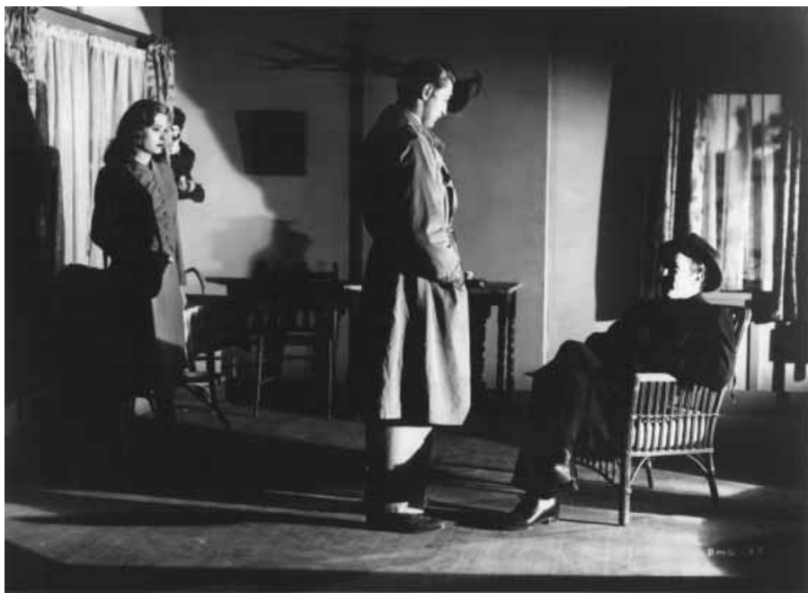
14. Out of the Past : Antitraditional mise-en-scène expressing a grim, romantically stylized view of the world. (Jane Greer, Robert Mitchum, Steve Brodie)

The defining presence of a detective hero had made the detective film seem less problematic from the beginning. Considering the formulaic nature of detective fiction, it was eminently predictable that its conventions would attract the attention of Tzvetan Todorov, the first-generation structuralist most interested in popular forms.