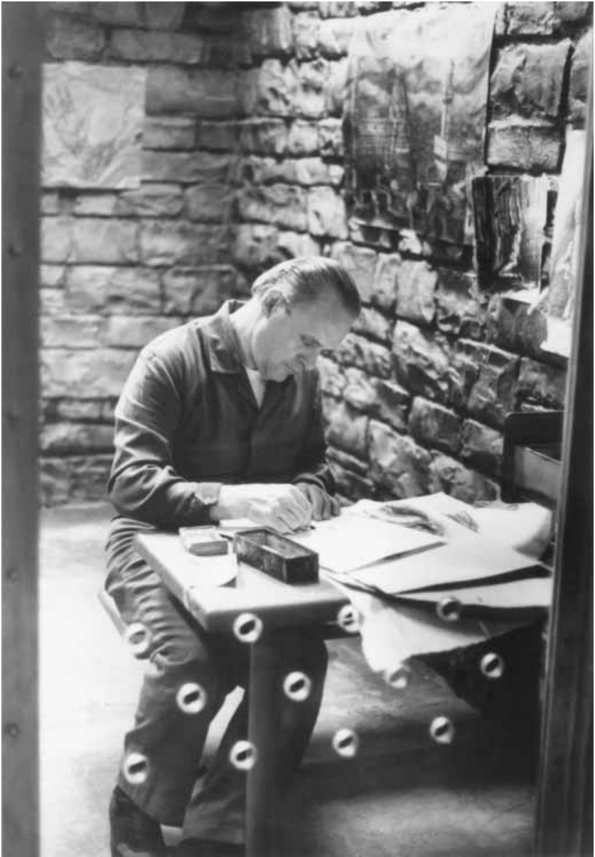
2. The Silence of the Lambs : A police film that is also a study of a monstrous criminal. (Anthony Hopkins)