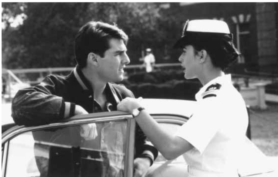
61. A Few Good Men : Lt. Kaffee (Tom Cruise) fights with everyone, even allies like Lt. Cmdr. Galloway (Demi Moore).

official (the clandestine order immediately afterward to institute a “Code Red” against the informer); orders from one’s legal superiors against individual conscience, and hence individual against group welfare; and finally the authority of the Marine command against that of the court. So powerful are these conflicts that Lt. Col. Matthew Markinson (J. T. Walsh) is destroyed by them, and even Kaffee’s two clients obtain only a split verdict on their actions.