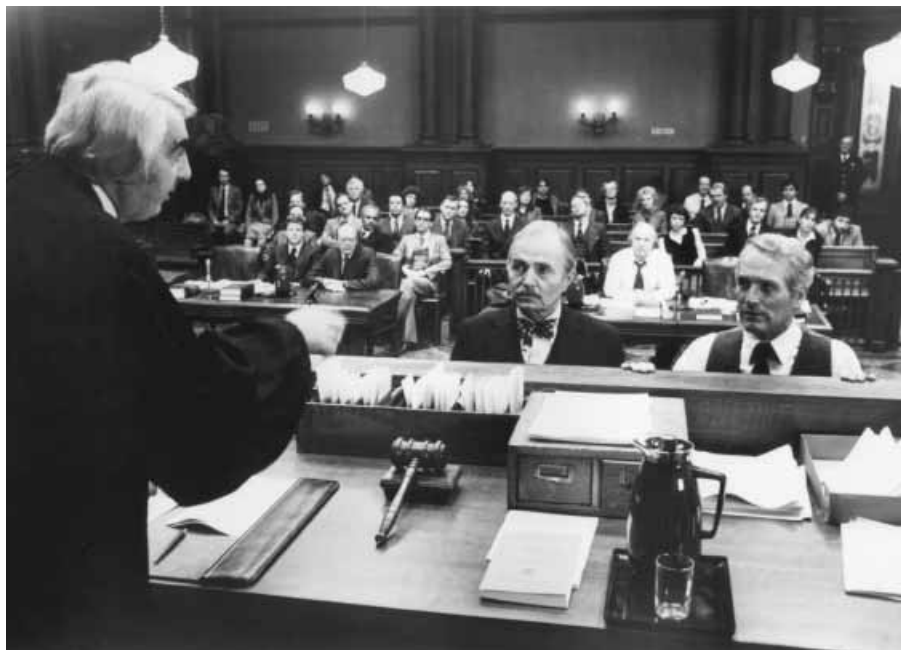
60. The Verdict : Shirt-sleeved Frank Galvin (Paul Newman) takes on the Boston Goliath Edward J. Concanon (James Mason) before Judge Hoyle (Milo O'Shea).

his life by deserting the 9th Cavalry, which he calls “my home, my real freedom, and my self-respect.” Hence the design of the film, alternating low-ceilinged interiors with low-horized exteriors, closely echoes that of its black-and-white predecessor Stagecoach (1939), also directed by John Ford and photographed by Bert Glennon. The contrast confirms the judgment of Rutledge’s lawyer, Lt. Thomas Cantrell (Jeffrey Hunter): “It is this court that stands on trial, and not Sergeant Rutledge.”