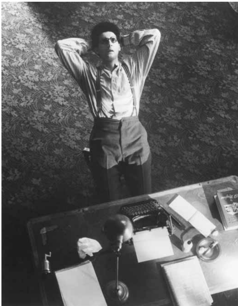
70. Barton Fink : The writer hero (John Turturro) is blocked, but not the Coen brothers, in their breakthrough film.