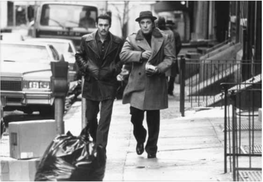
56. Donnie Brasco : The undercover cop (Johnny Depp) and his unwitting mob mentor (Al Pacino).

tional conflicts concerning authority and the law. The crucial period in the Hollywood police film is the late 1960s and early 1970s, not only because it is a period of unprecedented economic freedom and formal experimentation in American films generally, 4 but because a spate of rioting in Watts (1965), Detroit (1967), Newark (1967), and on innumerable college campuses – culminating in the National Guard’s killing of four students at Ohio’s Kent State University (1970) – fed public debate about both police tactics and the legitimacy of the government they represented.