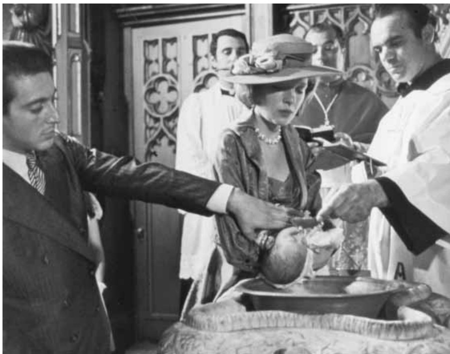
27. The Godfather : Michael rejects Satan on behalf of the godson whose father he is about to have killed. (Al Pacino, Diane Keaton)