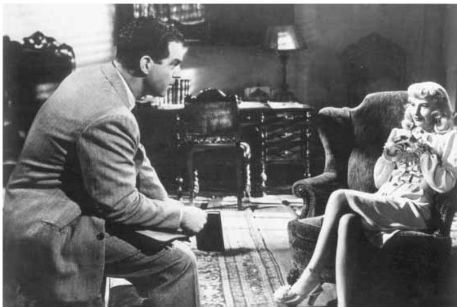
30. Double Indemnity : Walter (Fred MacMurray) admires the fetishistic anklet worn by Phyllis (Barbara Stanwyck).

Crazy and in The Big Heat (1953), in which the revolver framed in isolation just after the credits fires the shot that sets the whole story in motion – that the fetish can be inverted or satirized in The Maltese Falcon and The Big Sleep (1946), whose private-eye heroes regularly ignore or disarm villains who depend on their artillery, and Kiss Me Deadly , whose sociopathic private eye is forced to find new ways to hurt the suspects he interrogates after the police confiscate his gun.