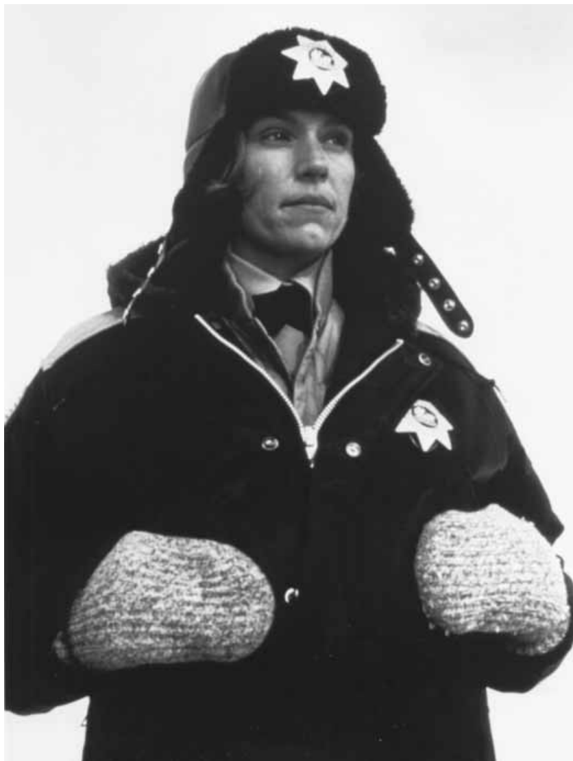
73. Fargo : Marge Gunderson (Frances McDormand) – good-humored earth-mother or unimaginative dolt?

sents poses as direct an affront to the criminal outrages perpetrated by the kidnappers as their outrages do to the ideas of normalcy represented by Jerry's smile, Paul Bunyan's statue, and the film's endless wastes of snow. Nor does the film show either side able to comprehend the other, either in individual collisions or at the fadeout; it mere-