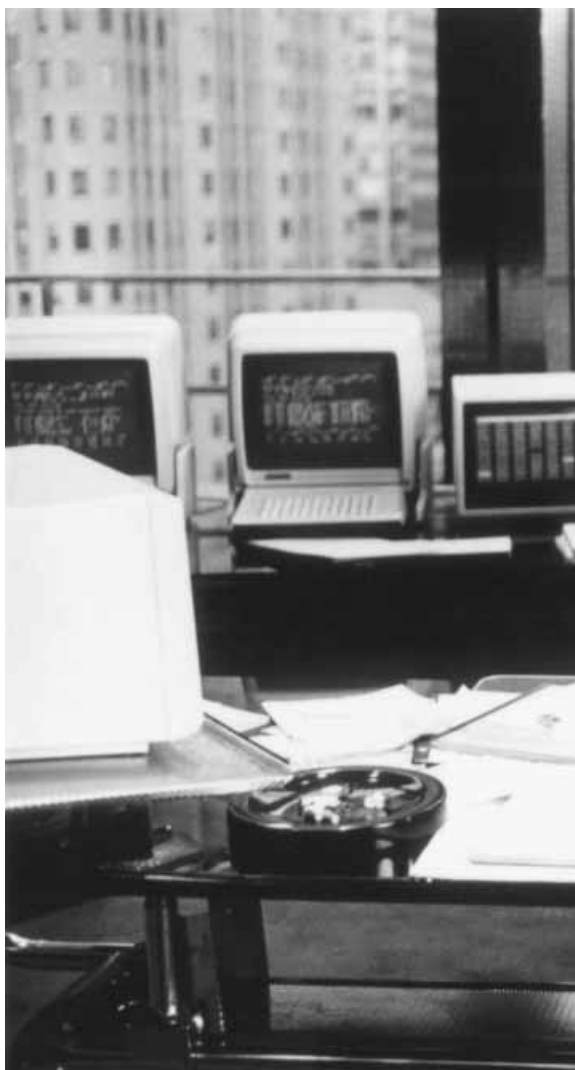
76. Wall Street : Michael Douglas as the king of white-collar crime.

man-on-the-run story, has been analyzed at length not only by Charles Derry and Martin Rubin 7 but by forty years' work of commentary on Alfred Hitchcock. To emphasize the importance of such films from The 39 Steps (1935) to The Fugitive (1993) to the crime genre would foreground questions not only about the fugitive's and the pursuing system's moral complicity but about the range of tactics fugitives employ to keep one step ahead of the law. To emphasize films about white-