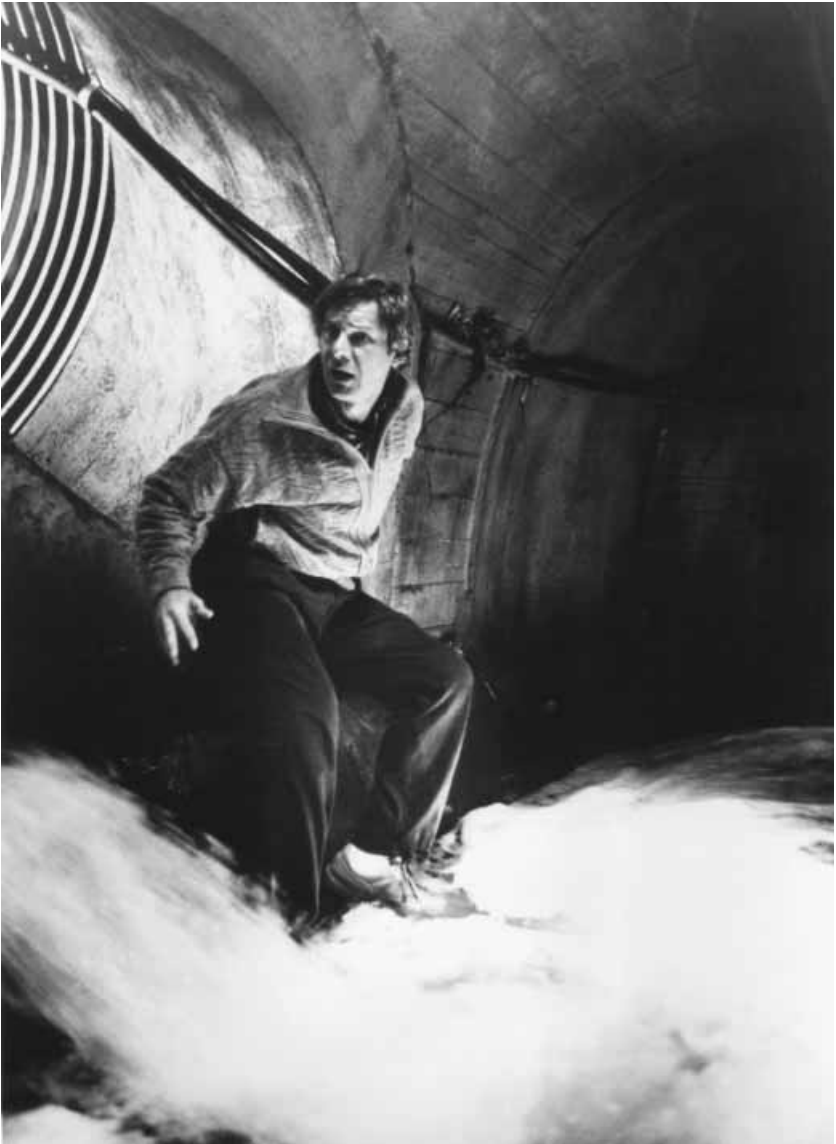
18. The Fugitive : Instead of simply escaping from the police, Dr. Richard Kimble (Harrison Ford) must track down the real criminal.

unconvincing self-justifications of D-FENS in Falling Down indicates that American movies do not necessarily approve this kind of empowerment; but they are clearly fascinated with it, whatever its costs, even at its most sociopathic [Fig. 19].