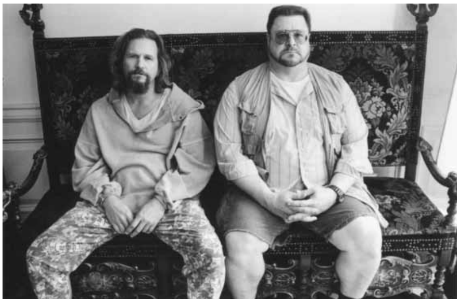
74. The Big Lebowski : A naïf sucked into a world of kidnapping, bowling, and impossible dreams come true. (Jeff Bridges, John Goodman)

ly shows that each exists in the other, like yin and yang, so that the criminal world is as comically normal as the normal world is comically outrageous.