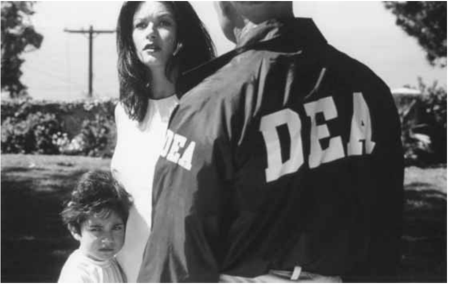
79. Traffic : Catherine Zeta-Jones as one more victim who turns criminal to survive.

with himself over whether he should emulate the mob that tried to kill him in Fury . Double Indemnity 's Walter Neff and Basic Instinct 's Det. Nick Curran are drawn into criminal behavior through their involvement in forbidden romance. J. J. Gittes confronts his own pettiness and greed in Chinatown , and Jeffrey Beaumont his outlaw sexuality in Blue Velvet , through their battles with monstrous antagonists; Det. Lt. Frank Bullitt and Alan Dershowitz confront endless criticisms of their work; Marge Gunderson restores law and order to Fargo by her failure to understand the dark humor her story embodies; even Hercule Poirot, in Murder on the Orient Express , ends by covering up a crime committed by a group of vigilantes whose cause he feels is just. Each of these films, like the subgenres they represent, appeals to the audience's own antisocial tendencies by cloaking them in the glamour and mystery of the criminal, reassuring the audience that this fantasy is only a waking dream, and leaving behind a lingering suggestion that the duality of right and wrong that supported it may be due for a closer look next week.