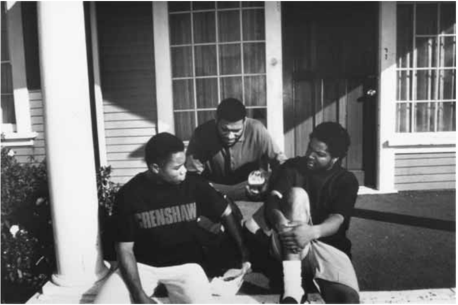
23. Boyz N the Hood : Gang loyalties based on childhood friendships. (Cuba Gooding Jr., Larry Fishburne, Ice Cube)

recruited specifically for the skills they bring to a proposed heist. Both Howard Hawks's Scarface and Brian De Palma's 1983 remake emphasize the gradual withdrawal of the gangleader from the day-to-day operations of the gang. By the time of New Jack City (1991), kingpin Wesley Snipes's involvement in his thriving cocaine empire seems to be limited entirely to executing traitors and consuming his own product.