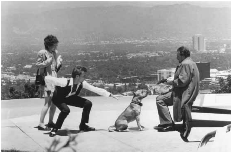
12. 2 Days in the Valley : Ironic crime comedy in the tradition of Pulp Fiction . (Glenn Headly, Greg Cruttwell, Danny Aiello)

binning both perspectives in films like Blue Velvet and Pulp Fiction , popular fascination with the law soared to new heights. Although Americans regularly affirmed their disillusionment with courts and lawyers, they responded eagerly to fictional representations of the law. Fueled by Scott Turow's novel Presumed Innocent (1987), which turned a criminal prosecutor into the defendant in a high-profile murder case, and John Grisham's The Firm (1989), which allowed a rookie lawyer to disentangle himself from his mob-connected Memphis firm, the legal thriller became a best-selling literary genre for the first time since Robert Travers's Anatomy of a Murder (1956). Nor was this triumph restricted to fictional courtroom drama. The success of Court TV and the replacement of the heavily fictionalized television program Divorce Court by the real-life proceedings of The People's Court and Judge Judy groomed a new audience for an apparently limitless succession of unofficial Crimes of the Century, each of them minutely described, analyzed, cataloged, and second-guessed in the news media by the few legal experts who were not busy grinding out their own novels. O. J. Simpson's two trials, for murder and for violating his murdered wife Nicole Brown Simpson's and her late friend Ronald Goldman's