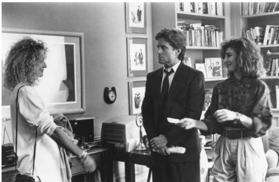
33. Fatal Attraction : Another weak hero (Michael Douglas) trapped by his own passivity between his inamorata (Glenn Close) and his wife (Anne Archer).

pling with Alex on her kitchen sink, Dan's associations with sex turn overwhelmingly negative; yet that does not prevent them from operating as fetishes – it merely makes them negative fetishes for which he still, by virtue of the patriarchal values that made him susceptible to Alex in the first place, must bear responsibility.