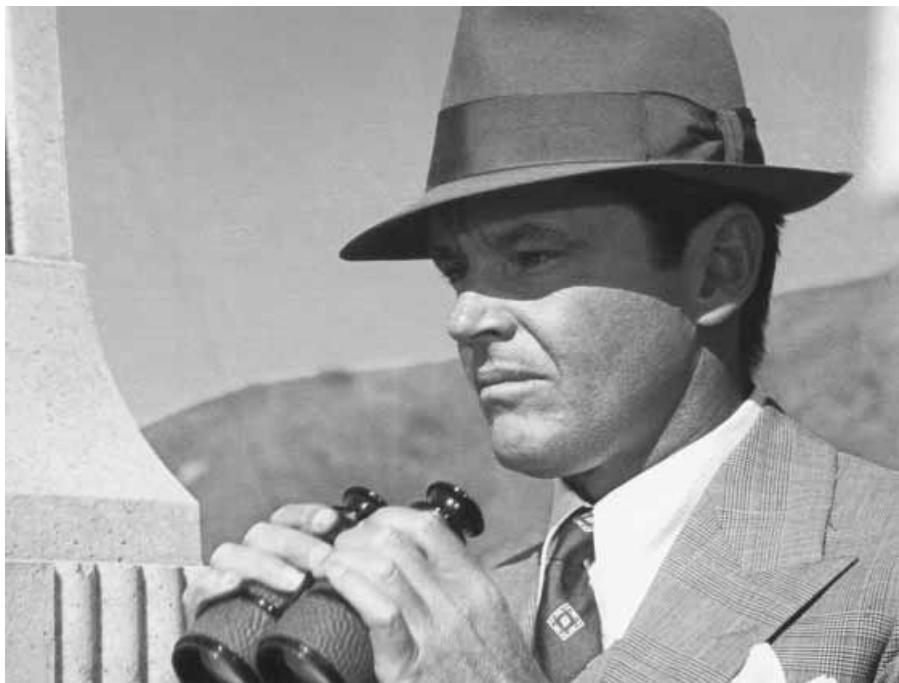
45. Chinatown : A hero (Jack Nicholson) who does nothing but watch.

ent. If Gittes is following a man rather than a woman, it is a man whose lack of masculinity, already foreshadowed by his effeminate bowties, his self-effacing manner, and his mildly ineffectual arguments against the new dam, will become steadily more apparent as the film proceeds, apparently confirming Gittes's own manliness through the private eye's formulaic algebra of contrast.