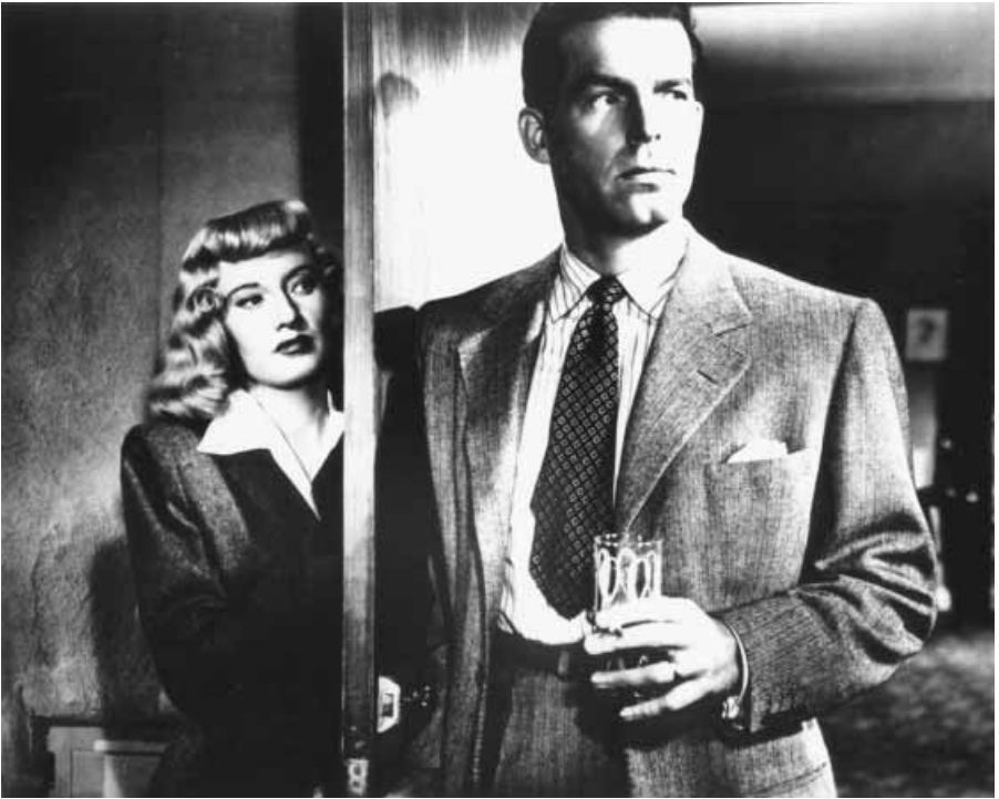
31. Double Indemnity : The hero (Fred MacMurray) trapped by his knowledge of his guilty double (Barbara Stanwyck).

failed protégé Walter's rogue salesman, who always dresses in non-committal gray suits, except when he is impersonating the man he is planning to kill. But these external doubles are only a sign of a deeper psychological doubling that is revealed by Walter's incautious gaze over Phyllis's shoulder while she tellingly remarks, "I hope I've got my face on straight" (indicating that her face is simply a mask assumed for the occasion), and he replies, "It's perfect for my money" (indicating that he is only too eager to accept the mask at face value without looking deeper). This sort of doubling is represented in different terms when Phyllis, coming to visit Walter's apartment after the murder, hears Keyes inside and hides behind the apartment door as Keyes comes out into the corridor, trapping Walter between the two people who are contending for his soul. As Walter poses before the blank door with Phyllis and Keyes on either side of him, the film asks which Walter will prevail: Phyllis's conspirator or Keyes's employee? It answers this question when he shields Phyllis from Keyes, waving her in back of the door with a telltale hand [Fig. 31].