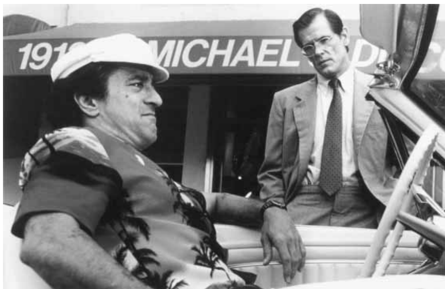
77. Cape Fear (1991): Robert De Niro's downscale sociopathology. (De Niro, Nick Nolte)

1994) or businesspeople whose turn toward literal criminality indicts their professional milieu metaphorically ( The Lavender Hill Mob , 1951; The Bad Sleep Well , 1960; A Shock to the System , 1990; Glengarry Glen Ross , 1992; American Psycho , 2000). Films about outlaws – sympathetic lawbreakers like Robin Hood, Jesse James, and the protagonists of Thelma & Louise (1991) – provoke debates about the morality of the established order. Films about prisons like those in The Big House (1930), 20,000 Years in Sing Sing (1932), and Brute Force (1947) present them as social microcosms from which escape, the convicts' one obsession, is no more possible than from life itself; even when Tom Connors (Spencer Tracy) does escape from Sing Sing, he is obviously fated to return. The doomed capers in The Asphalt Jungle and The Killing (1956), whose gangs are assembled, like pickup ball teams, for the purpose of pulling off one big job, exchange the romantic fatalism of the gangster film's promethean, system-defying individual hero for a cynical fatalism about social organizations themselves.