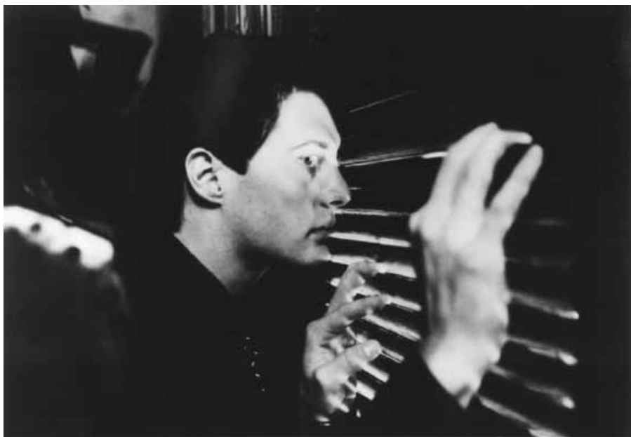
41. Blue Velvet : Jeffrey (Kyle MacLachlan) about to come out of the closet at knifepoint.

she and Jeffrey are walking the streets of Lumberton together), or weirdly uplifting liturgical music. When Sandy tells Jeffrey of a dream in which a dark, loveless world was brightened by the arrival of thousands of robins bearing “this blinding light of love,” her recitation is accompanied by organ music from the church whose stained-glass windows are framed in romantic soft focus behind her. Dorothy, by contrast, is associated exclusively with forbidden sexuality. She dresses entirely in black, red, or dark blue; her face, with its heavy coating of rouge and lipstick, is as fetishized as her wardrobe, especially in the extreme close-ups that repeatedly show her parted lips; her deep, mournful voice bespeaks sex as a painful ritual to be suffered, not consecrated in a church. No one would ever describe Dorothy, as Jeffrey describes Sandy, as “a neat girl” with whom it would be a pleasure to fall in love; she is rather the sex partner Jeffrey can neither acknowledge nor resist.