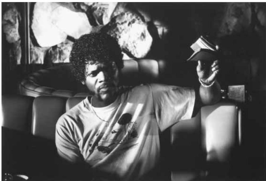
3. Pulp Fiction : A noir world of criminals like Jules Winnfield (Samuel L. Jackson) without the noir visual style.

genre than theorists of subgenres like the gangster film and the film noir have acknowledged. In fact, it is a stronger genre than the criminal subgenres that have commanded more attention, not only because its scope is by definition broader than theirs, but because the problem it addresses as a genre, the problem that defines it as a genre, places the film noir and the gangster film in a more sharply illuminating context by showing that each of those is part of a coherent larger project.