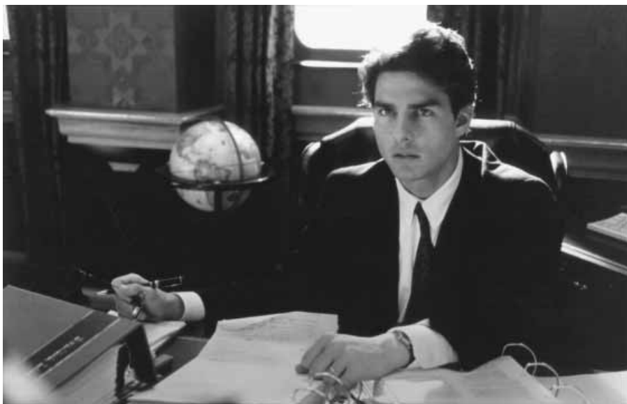
62. The Firm : Cruise again, as a lawyer hero who has not even passed the bar exam.

are apparently more representative of the justice system. Julia Roberts's eponymous heroine in Erin Brockovich represents the antilawyer (trash talk, sexy clothes, unlimited empathy) who is also a nonlawyer. (Her herculean efforts on behalf of her boss's pro bono clients are bracketed by two memorable remarks: "I hate lawyers. I just work for 'em," and "Tell her I'm not a lawyer. That may help.")