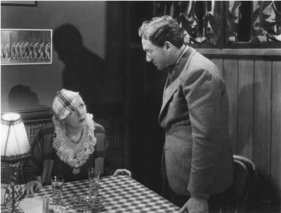
20. Fury : Joe Wilson (Spencer Tracy) is alone wherever he goes, even in this intense face-off with a girl in a nightclub (Esther Muir), cut from the ending of the completed film.

Realizing that his irrational quest for legalized vengeance is dehumanizing him as surely as the mob surrendered its own humanity, and that they are presumably as haunted by his specter as he is by Katherine's, Joe is ready to show himself in the courtroom, in a final revelation – he drops the pretense of his death and Katherine returns to him – that was criticized from the film's first release as abrupt and unmotivated. 7 This ironically convenient ending is unsatisfactory precisely because it admits that the film's ruthless unmaskings have raised contradictions too deep to resolve. Not only have both middle America and Joe been revealed as morally inadequate in the eyes of the law; but the law itself, though it has persistently been set up as the force that protects individuals from each other and, ultimately, from their own most catastrophic impulses, has been unmasked as fallible and corrupt. 8