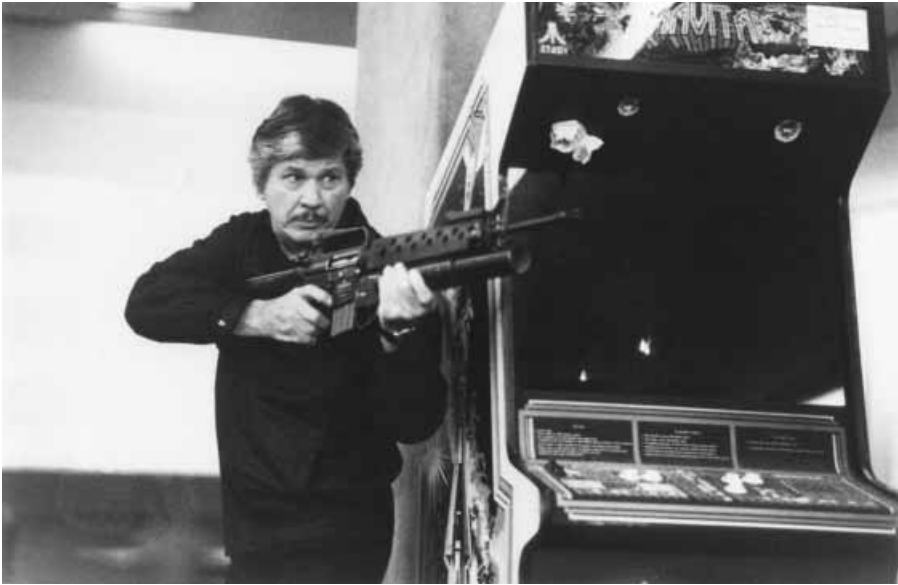
17. Death Wish 4: The Crackdown : The victim (Charles Bronson) turned avenger.

precarious height and become victims, like the outsized gangsters of Little Caesar (1930) and Scarface (1932), or they want heroic victims to move from suffering to action, like the wimps played by Dustin Hoffman in Straw Dogs (1971) and Marathon Man , and by Charles Bronson in all five Death Wish films (1974–94) [Fig. 17].