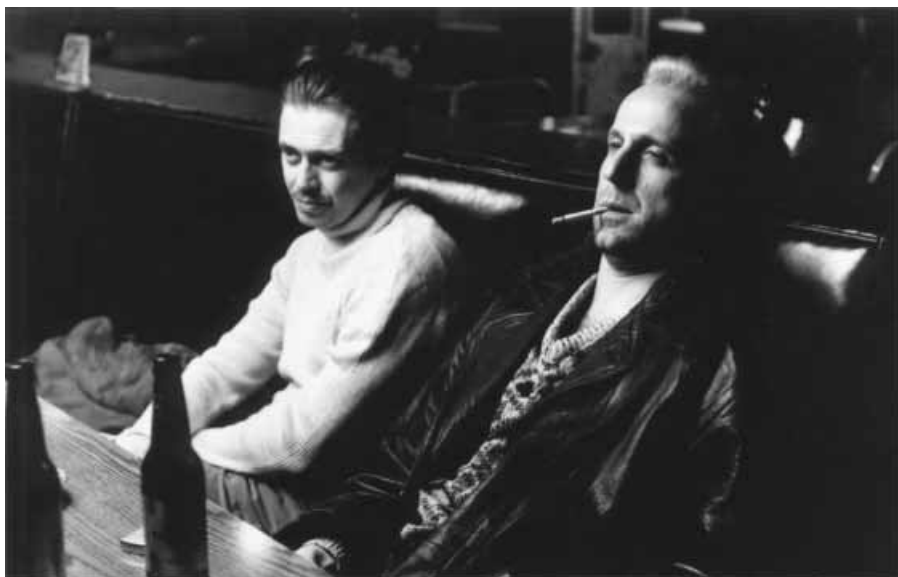
71. Fargo : Indoors, the emotional temperature of the opening scene between Jerry and the thugs (Steve Buscemi, Peter Stormare) he wants to hire is no warmer.

their victim tied up in the back seat, are pulled over for driving with an expired registration, and taciturn Gaear Grimsrud (Peter Stormare) brutally kills the police officer, then chases down two witnesses who saw the corpse as they were driving past and murders them as well. Four more victims will follow, dispatched in increasingly hair-raising ways, until Brainerd police chief Marge Gunderson (Frances McDormand, in her Oscar-winning role), investigating the murders, surprises Gaear as he is feeding the leg of his late partner, Carl Showalter (Steve Buscemi), into a wood chipper, producing instead of chips a haze of bright blood.