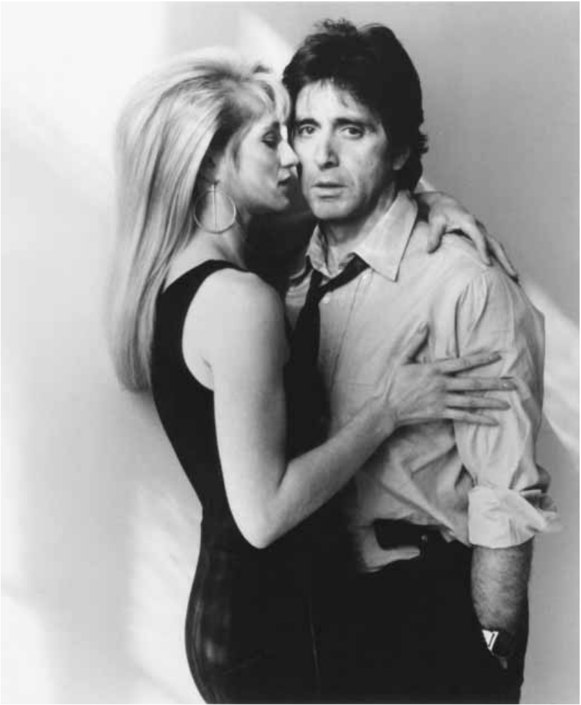
35. Sea of Love : Another compromised cop, another reckless affair. (Ellen Barkin, Al Pacino)

cently, on the job. After initially considering Catherine an adversary who provides a rationale for his professional identity, Nick is eventually forced to see her as the untrammelled self he longs to be.