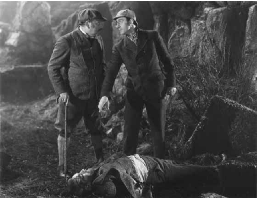
5. The Hound of the Baskervilles : Nigel Bruce and Basil Rathbone as the best-loved Watson and Holmes of all.