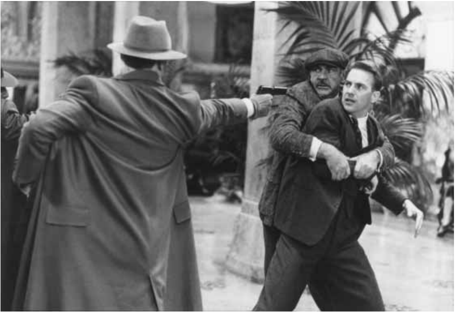
49. The Untouchables : Police power (Sean Connery, Kevin Costner) trumped by the greater power of Al Capone's bodyguards.

Nonetheless, viewers routinely assume the police will succeed. Sometimes their confidence is justified by their knowledge of history, as in The Untouchables , in which audiences' awareness of how Capone was actually brought down makes an ironic joke of the apparently pointless efforts of Oscar Wallace (Charles Martin Smith) to prove Capone guilty of tax evasion. Other times, audiences rely on internal foreshadowing and narrative logic, as in One False Move (1991), in which it is clear early on that the three criminals fleeing from Los Angeles to faraway Star City, Arkansas, are actually running into the arms of the law. Even when they have neither history nor any specific foreshadowing to guide them, however, audiences' experiences of films whose stars are cast as police officers will be framed by their experience of generic conventions in myriad earlier police films, which predict, with remarkably few exceptions, the success of the police, at whatever cost, in identifying and apprehending or destroying the criminals.