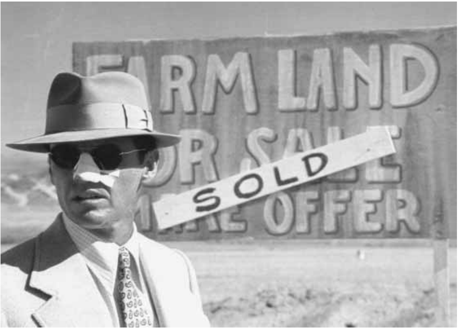
47. Chinatown : The disfigured nose of Gittes (Jack Nicholson) marks his vulnerability and rationalizes his suspicions of treacherous women.

personal revenge; but it also confirms his status as a former or potential victim whose heroic status is hard-won and liable to be revoked, particularly when he falls into the clutches of a treacherous woman [Fig. 47].