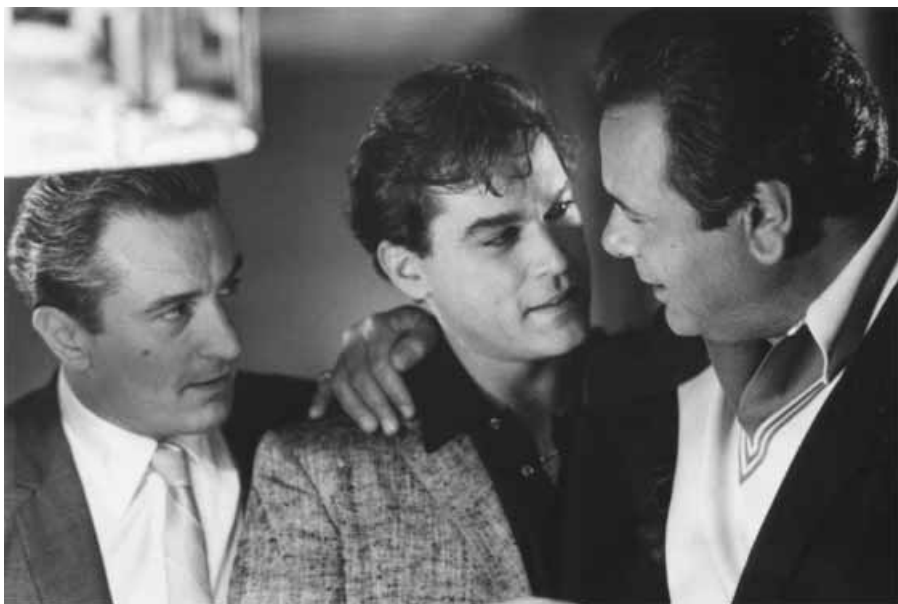
22. GoodFellas : “Keep your mouth shut, and don’t rat on your friends.” (Robert De Niro, Ray Liotta, Paul Sorvino)

called in to help you dispose of a dead body have to say “please” when he tells you what to do? Though it is ironic that films and gangs organized around breaking the rules should be so preoccupied by the rules they establish in their place, it is eminently logical for gangsters to spend their time debating rules of conduct and morality, because in opting out of the social norms that everyone else takes for granted, they alone are forthrightly considering the question of what rules ought to be followed and why.