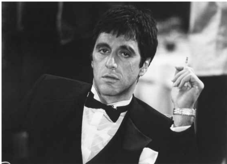
9. Scarface (1983): Marielito Tony Montana (Al Pacino) wasted by the drugs that mark his success.

creasingly condemned as a trigger for the violence of youthful “super-predators” and high-school terrorists. On the other hand, violence was more and more successful, and more and more in demand, in selling movies to a generation of teenagers who had grown up with remote controls that had sharpened their impatience, discouraged the deferred gratifications of slow-moving films, and reintroduced Mack Sennett’s eighty-year-old principle of slapstick comedy: The introduction, buildup, and payoff of each joke had to take less than a minute.