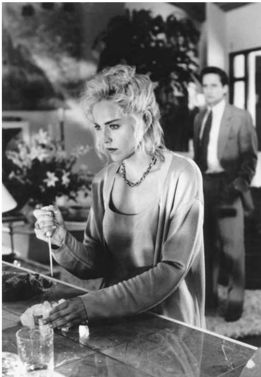
36. Basic Instinct : An unequal twinship in which the woman (Sharon Stone) wields the icepick.