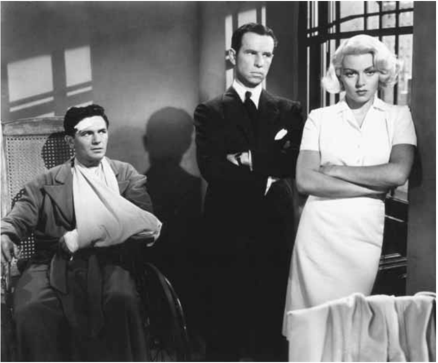
15. The Postman Always Rings Twice (1946): Is the hero destroyed by the femme fatale, or by his own weakness? (John Garfield, Hume Cronyn, Lana Turner)

corded to the femme fatale is a function of fears linked to the notions of uncontrollable drives, the fading of subjectivity, and the loss of conscious agency.” 54 James F. Maxfield is still more explicit: “The internal conflicts of the male protagonists are ultimately more important than external conflicts with other characters – even with the fatal woman. . . . The women are merely catalysts; in the end it is the men who are destructive to themselves” 55 [Fig. 15]. And Richard Dyer contends that “film noir is characterized by a certain anxiety over the existence and definition of masculinity and normality” – an anxiety that, since it cannot be expressed directly (for such a direct expression would admit the existence of the very problem it is the films’ work to obscure), is marked by the threatening predominance of nonmasculine images to indicate the boundaries of categories that cannot be constructed in positive terms. 56