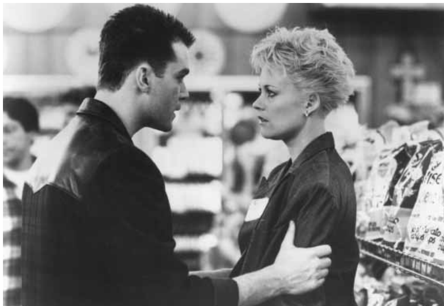
1. Something Wild : a crime film, or a screwball comedy gone wrong? (Ray Liotta, Melanie Griffith)

yet few viewers have called them crime films. If Sunset Blvd. (1950) is to be counted as film noir because of its confining mise-en-scène, its trapped hero, and its use of a fatalistic flashback, should Citizen Kane (1941) be counted as noir too? Is Something Wild (1986) [Fig. 1] a crime film or a screwball comedy gone wrong? Critics have often coined nonce terms like “superwestern” and “neo-noir” to describe films that transform or combine elements from different genres, but these terms raise as many problems as they solve. If Outland (1981) is an outer-space western – High Noon (1952) in space – is Assault on Precinct 13 (1976), John Carpenter’s homage to Rio Bravo (1959), an inner-city western?