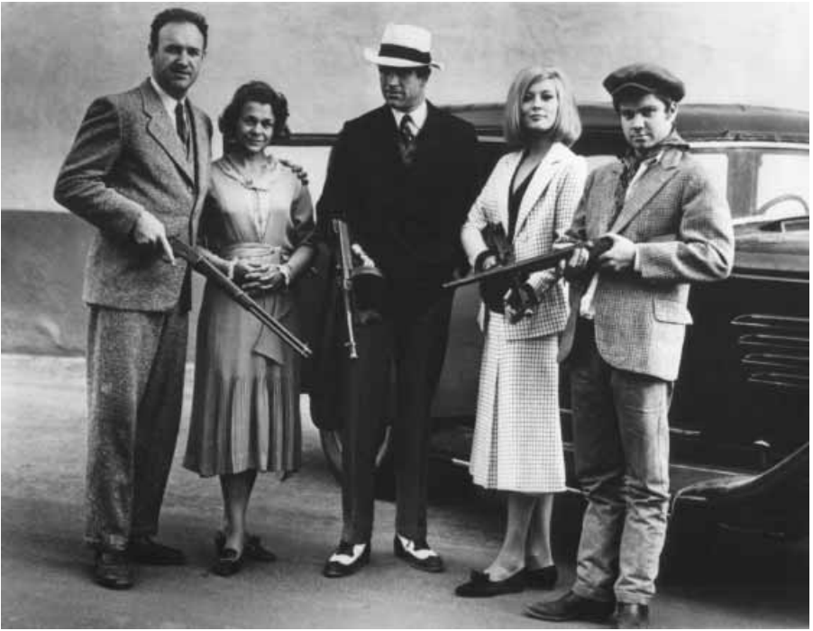
7. Bonnie and Clyde : Using thirties iconography to attack sixties authority. (Gene Hackman, Estelle Parsons, Warren Beatty, Faye Dunaway, Michael J. Pollard)

of 1967 unexpectedly reaped huge benefits from their antiestablishment tone: The Graduate and Bonnie and Clyde . Arthur Penn's flamboyant, affecting, and ultimately tragic saga of a pair of Depression-era gangsters, originally dismissed by reviewers as inconsistent and pointless, not only set new, post- Psycho standards for onscreen violence but helped identify a niche market of American teenagers who had previously had to make do with the likes of Pat Boone and Elvis Presley. Weighing Bonnie and Clyde's amoral killing against their youthful ignorance, the film managed to demonize the same American institutions as the gangster cycle of the thirties – the police, the banks, the law – but this time in metaphoric terms, using a pair of criminals from the thirties to attack the moral injustice of the draft and the violent injustice of the American experience in Vietnam [Fig. 7]. 24