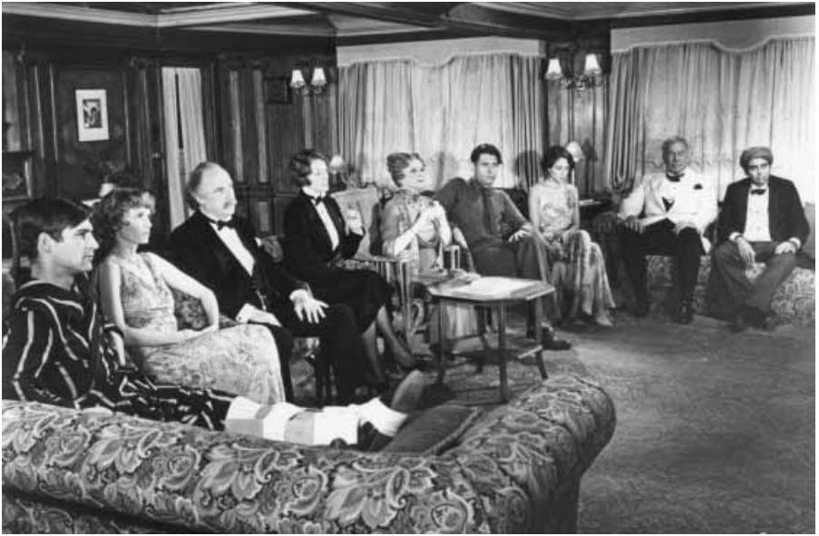
40. Death on the Nile : Different stars, but the same shot – a return to the Agatha Christie period. (Simon MacCorkindale, Mia Farrow, Jack Warden, Maggie Smith, Bette Davis, Jon Finch, Olivia Hussey, George Kennedy, I. S. Johar)

tween unofficial and official detectives but between habitual unofficial detectives like Hercule Poirot and Nancy Drew and one-time detectives like Richard Hannay (Robert Donat), the reluctant hero of The 39 Steps (1935).