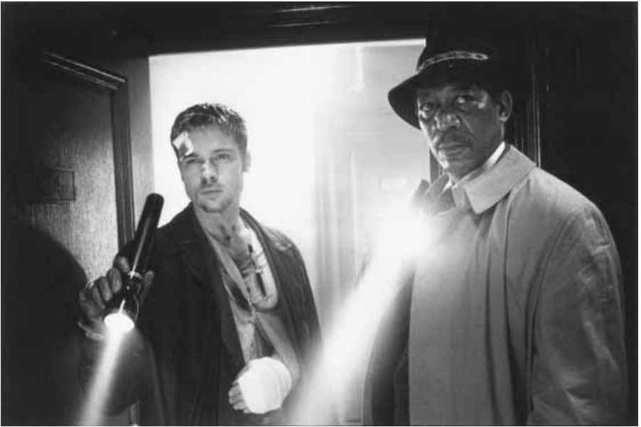
51. Se7en : Police officers (Brad Pitt, Morgan Freeman) led on by the criminal they are pursuing.

organized gang of criminals against an initially disorganized gang of police officers [Fig. 50]. Such films emphasize from the beginning strengths implicit in the police, and by extension the communities they represent and the authority that empowers them, by showing these strengths developing out of earlier weaknesses. Alternatively, instead of showing the police growing stronger, films may show the criminals growing weaker, as in police officers' use of variously complicit informers or the criminals' confessions. Such films, which predicate the power of the police on the weakness of criminal transgressors, more disturbingly compromise the duality between the police and the criminals by emphasizing the dependence of police work on the weakness or even the active collusion of criminals like John Doe in Se7en [Fig. 51].