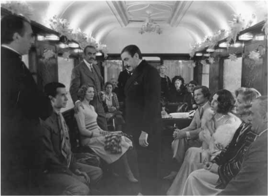
39. Murder on the Orient Express : Stars as scenery. (Jean-Pierre Cassel, Anthony Perkins, Vanessa Redgrave, Sean Connery, Ingrid Bergman, George Coulouris, Albert Finney, Rachel Roberts, Wendy Hiller, Colin Blakely, Michael York, Jacqueline Bisset, Lauren Bacall, Martin Balsam)

This reframing of the story's mystery by the terms of the film's production is echoed by its use of its period setting. Christie's novel – obviously inspired by the 1932 kidnapping of the baby of Charles Lindbergh, the aviator whose 1927 solo flight over the Atlantic had made him a hero – is set, like the film, in the early 1930s. Whereas Christie treats her setting as unobtrusively contemporary, however, the film emphasizes what has now become its remote historical period in a thousand ways, through costumes, hairdos, interior decor, and quaint vanished customs. The very presence of the anachronistic butler played by the iconic Shakespearean Gielgud frames the film's era as reassuringly as the repeated shots of the locomotive's belching smokestack. To the novel's original exoticism of place and class reassuringly remote from those of its middle-class target audience, the film thus adds the nostalgic framing of a remote historical period. Even the film's indirect allusions to the fatal Lindbergh kidnapping, separated from its audience by forty years and a murder conviction, become nostalgic in this context. This consistently archaeological