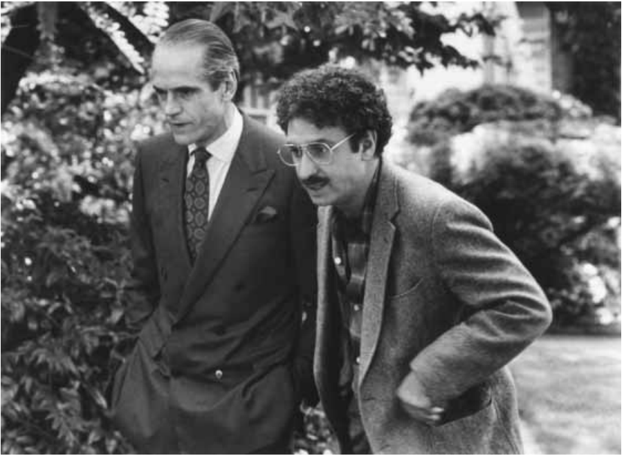
66. Reversal of Fortune : Dershowitz's patrician client looks more like a lawyer than he does. (Jeremy Irons, Ron Silver)

wife is replaced by his devoted son Elon (Stephen Mailer), his ex-lover Sarah (Annabella Sciorra), and his rowdy team of students-turned-colleagues, herded, in one of the few details borrowed from Dershowitz's book, into different rooms of his house according to their specific assignments. 2 When Dershowitz is on the telephone making still another argument on behalf of the Johnson brothers, Sarah's comment to Elon – "It's great when he's like this, huh? I only wish he had something left for the people around him" – simply confirms Dershowitz's own comfortable self-assessment: "My clients are the people I care about."