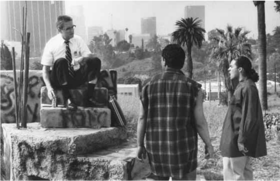
19. Falling Down : The fascination of the sociopathic vigilante. (Michael Douglas, left)

show how deeply they have been brutalized by making them cross the line that separates law-abiding avengers from criminals. It would be surprising if Hollywood did not try all three tactics, often in the same movie.