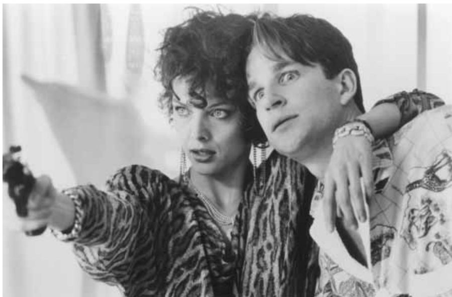
67. Married to the Mob : The embattled Mafia widow (Michelle Pfeiffer) and her ineffectual police suitor (Matthew Modine).

the incompetent detectives played by W. C. Fields in The Bank Dick (1940) and Groucho Marx in The Big Store (1941) and Love Happy (1950), Inspector Jacques Clouseau of the Pink Panther movies (1964–93), and Axel Foley in the Beverly Hills Cop franchise (1984–94). Finally, criminal threats can be defused and rendered comical if the criminals themselves are played for laughs, like the maiden-aunt killers of Arsenic and Old Lace (1944); the oblivious couple who commit the murders in Eating Raoul (1982) in hopes of financing a restaurant; the aspiring standup comic of The King of Comedy (1982) who kidnaps a talk-show host in order to break into show biz; and the mob boss in Analyze This (1999) who consults an unwilling psychiatrist when he unaccountably loses his appetite for killing [Fig. 68].