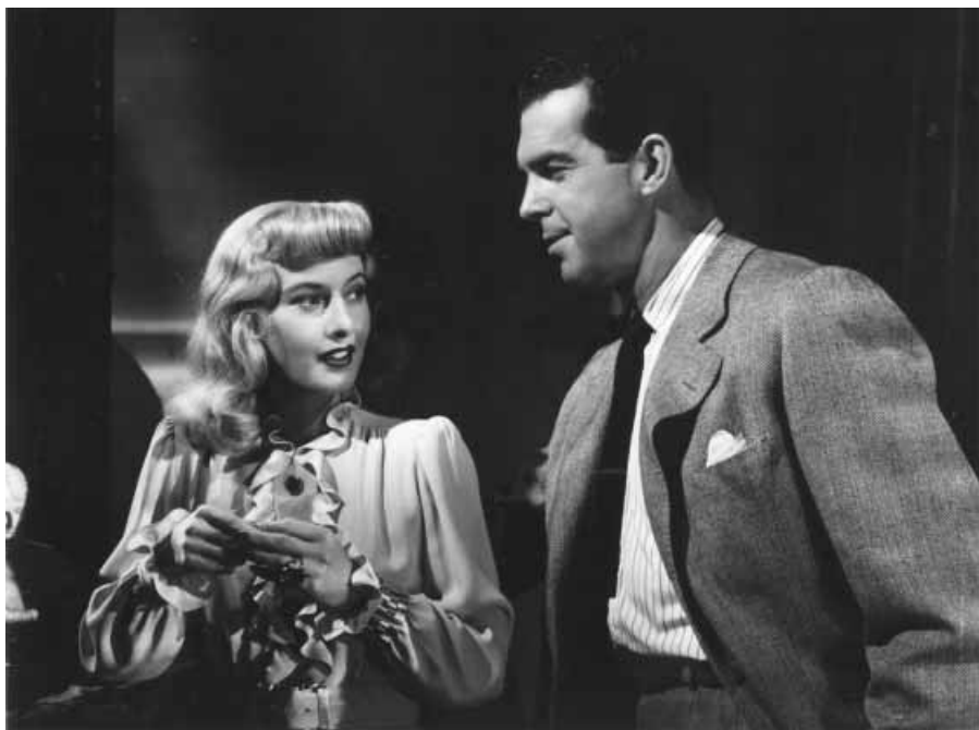
29. Double Indemnity : The femme fatale (Barbara Stanwyck) and her victim (Fred MacMurray).

from the film also underlines one of its most cynical jokes: the absence from the film of any police officers, emphasizing Cain's belief in both Double Indemnity and The Postman Always Rings Twice that the officers sworn to uphold the law have much less interest in its enforcement than the insurance companies who stand to lose financially from any fraud.