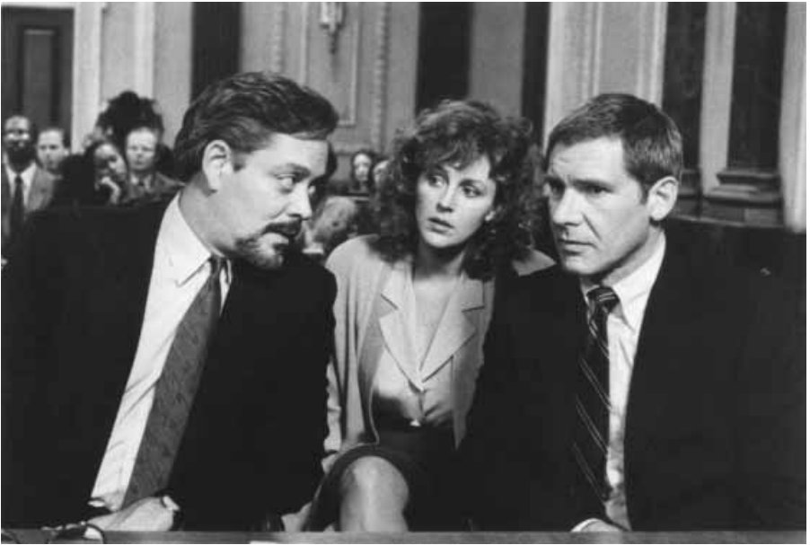
63. Presumed Innocent : Harrison Ford as a lawyer hero no more or less innocent than anyone else. (Raul Julia, Bonnie Bedelia, Ford)

and then tracking down a hospital corridor toward the open door of the room where Sunny von Bülow lies in an irreversible coma, attended by round-the-clock nurses who monitor her condition, bathe her, and turn her body to prevent bedsores, leaving her, as she puts it in disembodied voice-over, “brain dead, body better than ever.”