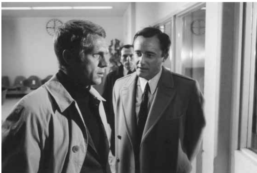
58. Bullitt : The self-contained hero (Steve McQueen) confronts his real enemy, the hypocritical prosecutor (Robert Vaughn), at the airport.

unapologetic Chalmers, who attempts to press his claim on the tarnished Ross's testimony by telling Bullitt that even though his star witness has now been proved a killer who faked his own death, he is still determined to get him to testify [Fig. 58]. "The Organization – several murders – could all do us both a great deal of good," he adds. "We both know how careers are made. Integrity is something you sell the public. . . . We must all compromise," with a scorchingly quiet reply: "Bullshit. Get the hell out of here now." By this time, Bullitt's emphatic rhetoric (the word "bullshit" was rarely heard in 1968 movies) on behalf of the pancultural cachet of law enforcement over the rule of law the film reserves to the gratingly upper-class Chalmers and his minions is backed by the dangerous physical actions that gives his words their authority.