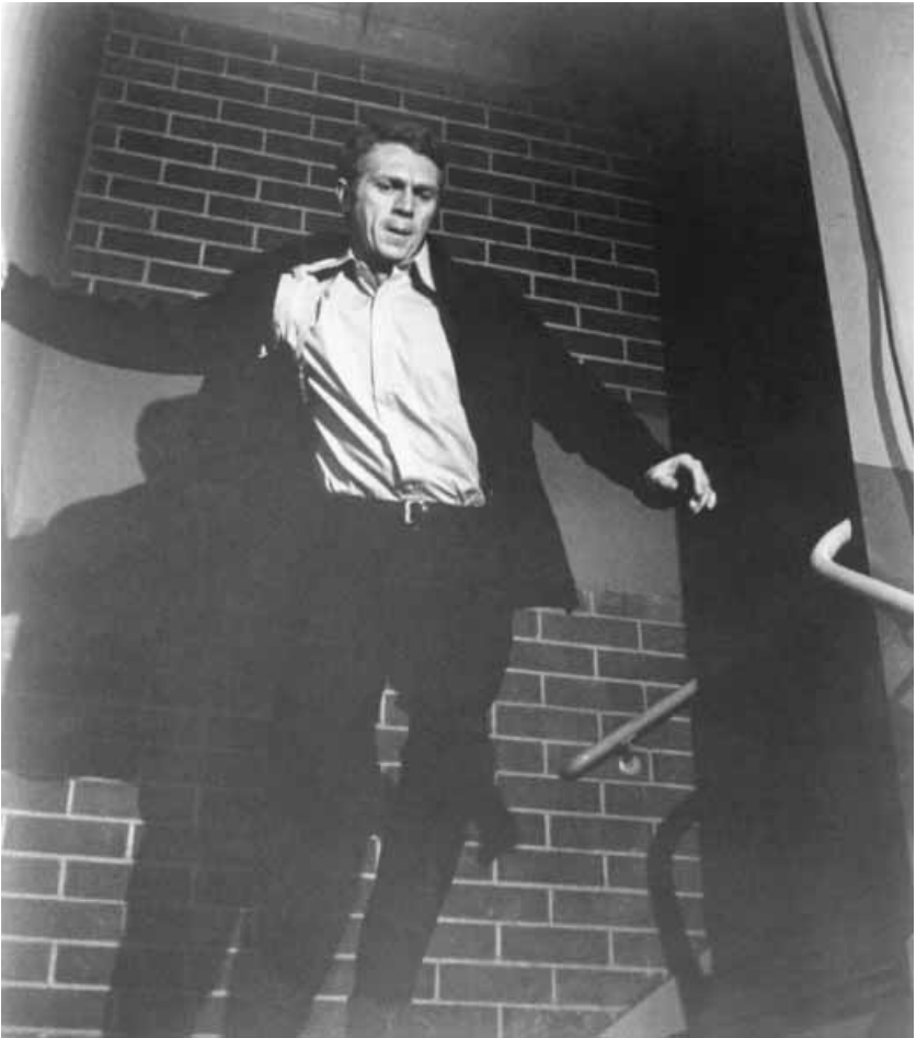
57. Bullitt : The athletic hero (Steve McQueen) chases his ostensible enemy through the hospital.

ing risks to capture them because they are all too used to cutting legal corners in the course of their job.