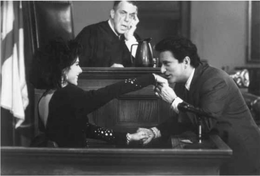
8. My Cousin Vinny : The antilawyer turned lawyer hero. (Marisa Tomei, Fred Gwynne, Joe Pesci)

highly addictive crack that was subject to the most severe criminal penalties.