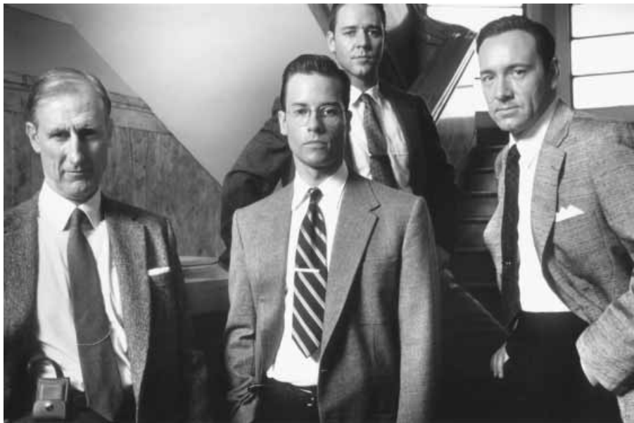
50. L.A. Confidential : An ill-assorted police team (James Cromwell, Guy Pearce, Russell Crowe, Kevin Spacey) that has not yet begun to work as a team.

law's powerlessness, the weakness of the authority that gives it moral and legal force, and the resulting lawless chaos; the final resolution reflects their confidence in the law and the justice of its tactics, however violent, even lawless, they may seem. It is a primary task of police films to mediate between these two attitudes, expressing audiences' skeptical fears about the justice system while leaving them ultimately confident in its workings.