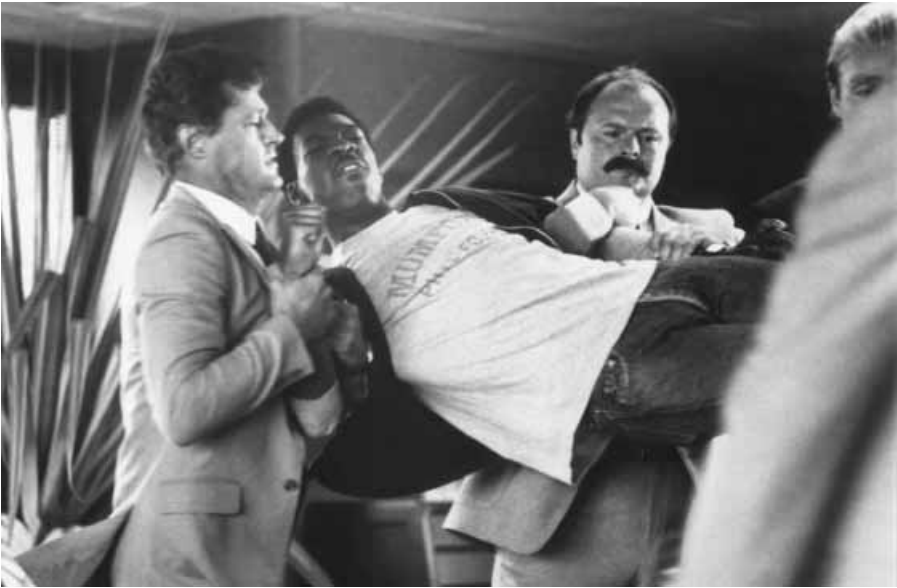
11. Beverly Hills Cop : Eddie Murphy (center) as anti-authoritarian authority figure.

personality a pig would have to have to be edible, offered an exuberantly comic counterpoint to Lynch's nightmare vision of middle America. Tarantino's trademark moments – the plunging of a hypodermic into the breast of the untouchable, accidentally overdosed gangster's wife Mia Wallace (Uma Thurman), the double-crossing boxer Butch Coolidge (Bruce Willis) and his mortal enemy Marsellus Wallace (Ving Rhames) taken prisoner by a pair of homosexual rapists much more dangerous than they are, the accidental point-blank shooting of the gang member being asked by Vincent Vega (John Travolta) whether he believes in miracles – treat criminal violence as a cosmic joke whose point, like the threat of nuclear holocaust in Dr. Strangelove (1964), is precisely that jokes are an inadequate response to death, chaos, and annihilation. The nature of Lynch's and Tarantino's jokey send-ups of contemporary social anxieties by translating them into impossibly elaborate criminal plots inaugurated a hip new subgenre of ironic crime comedies like 2 Days in the Valley (1996) [Fig. 12], Happiness (1998), Lock, Stock, and Two Smoking Barrels (1999), Go (1999), and Nurse Betty (2000).