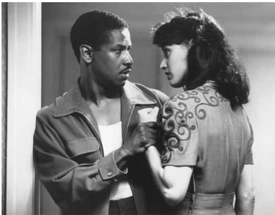
43. Devil in a Blue Dress : This shot is just about all that remains of the novel's interracial romance. (Denzel Washington, Jennifer Beals)

This defense of masculinity places debates about sex and power at the heart of all but a handful of hard-boiled films. It is true, of course, that The Thin Man (1934) combines a hard-boiled mystery with an intermittently lightsome celebration of the cockeyed domestic life of private eye Nick Charles (William Powell) and his wife, Nora (Myrna Loy). More recently, Devil in a Blue Dress (1995), shorn of the interracial romance that had capped Walter Mosley's 1990 novel [Fig. 43], uses race to displace sex as the matrix of the film's conflicts, focusing almost exclusively on the survival of Ezekiel "Easy" Rawlins (Denzel Washington), the unemployed aircraft worker who serves as the film's reluctant hero. In the white man's world he finds himself investigating, cops and crooks alike can beat him half to death without a reason, and asserting his identity requires a perilous tightrope dance between the Uncle Tom subservience white men demand and the reflexive brutality of his old friend Mouse (Don Cheadle), whose propensity for violence becomes disturbingly necessary to Easy's success [Fig. 44]. But