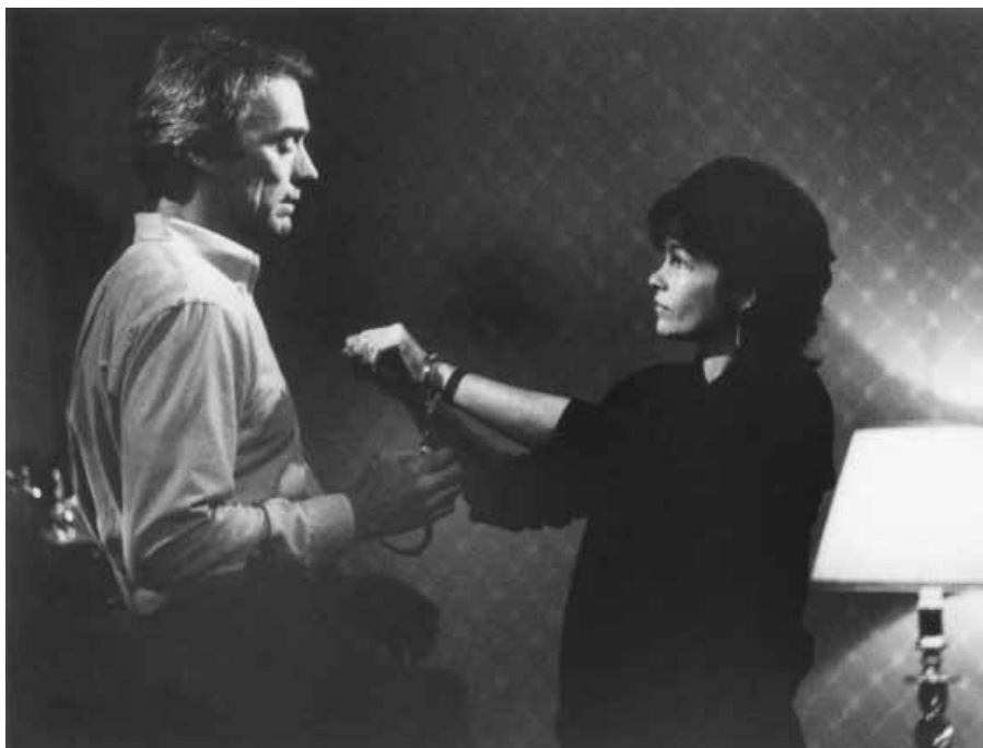
52. Tighrope : Wes Block (Clint Eastwood), a cop whose demonstration of handcuffs to Beryl Thibodeaux (Geneviève Bujold) hints at sexual tastes that are as kinky as those of the criminal he is chasing.

Pherson (Dana Andrews), the lead detective in Laura , has no better way to spend his nights than to return to a murder scene and stare at the painting of a dead woman. Like the western hero, the police hero is deprived of a domestic life in order to marginalize him from the social body he is supposed to be defending, even as his alienation reinforces his professional dedication.