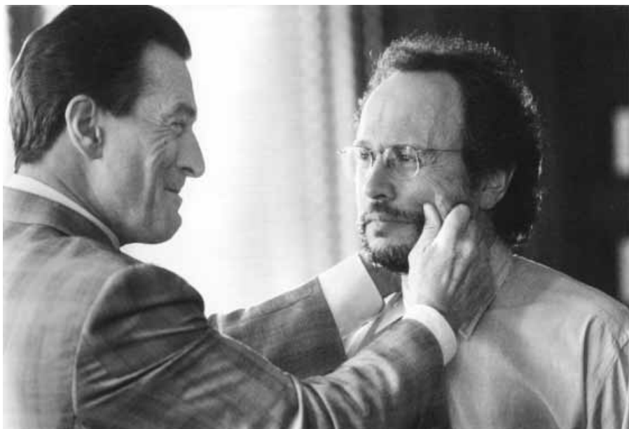
68. Analyze This : The iconic mob boss (Robert De Niro) and his unwilling psychiatrist (Billy Crystal).

unsuccessful traps for Road Runner, are so repetitious, both individually and as a series, and feature such a small cast of characters and so few possibilities for motivation and incident that their violent plots become reassuringly ritualized. Audiences who know that the coyote will never catch his innocent prey can relax and enjoy the complexity of his traps and the certainty that he will be caught in them himself, usually in ways unique to the drawn universe of cartoons. When the coyote steps over the edge of a cliff in his enthusiastic pursuit of Road Runner, for instance, he will never fall until he notices that he is in danger; he will have plenty of time for a farewell to the audience; and he will never suffer lasting damage from his well-deserved misadventures. The violence of the series, as the cliché “cartoon violence” suggests, is inconsequential. The ritual repetitions of highly predictable plots, spiced by the playful physical inventions, transformations, and impossibilities proper to the logic of the cartoon universe, at the hands of a villainous agent who will never grow out of his obsession or develop anything but a drolly ad hoc self-consciousness, all work in the service of a comically selective imitation of the real life of criminals, natural predators, and physical reality.