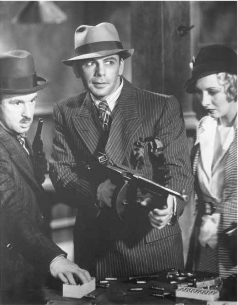
4. Scarface (1932): The Depression-era audience's ambivalence toward an upwardly mobile fantasy. (Vince Barnett, Paul Muni, Karen Morley)

face , the most violent of the new movies, was delayed for over a year while producer Howard Hughes dickered with the Motion Picture Producers and Distributors of America's Production Code Office (or Hays Office, as it was popularly called for its first leader, former Postmaster General Will Hays) over the film's bloodletting and overtones of incest.