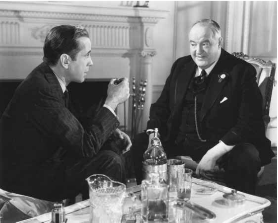
6. The Maltese Falcon : Humphrey Bogart as the private-eye hero tainted with guilty knowledge. (Bogart, Sydney Greenstreet)

in a pair of 1948 Huston films that confirmed the metaphoric power of the criminal, appearing as the psychotic Everyman Fred C. Dobbs in The Treasure of the Sierra Madre and as Lt. Frank McCloud in Key Largo , whose admonition to Americans to rouse themselves from their exhausted postwar apathy to battle the forces of evil represented by Johnny Rocco (Edward G. Robinson) makes it the most allegorical of all the great gangster films.