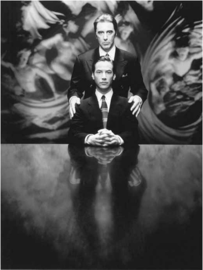
59. The Devil's Advocate : A lawyer hero (Keanu Reeves) literally in league with the Devil (Al Pacino).

(1992), A Time to Kill (1996), and Witness for the Prosecution (1957; based on a 1949 story and 1954 play by Agatha Christie), in which the magisterial Sir Wilfrid Robarts (Charles Laughton) takes a client he has proved to his own imperious satisfaction is innocent, only to be flimflammed by both the client and his resourceful wife.